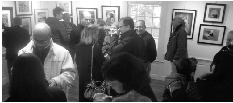
Visitors in the main gallery

The Art Guild welcomed over 150 guests to the Artists' Reception and Awards Ceremony for From My Perspective , on Saturday, February 4. The exhibit, featured 60 photographs by 58 photographers (including 24 high school students) chosen from over 230 images. The photographers brought a wide variety of photographic styles and interpretations of the theme.