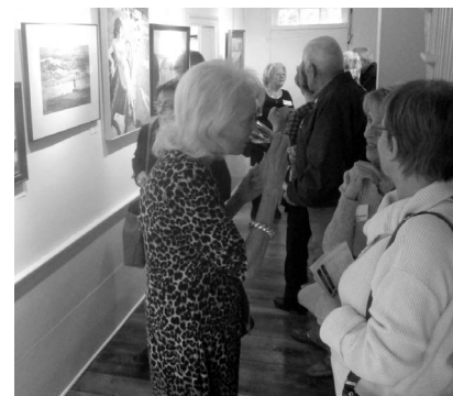
Artists and visitors in the gallery