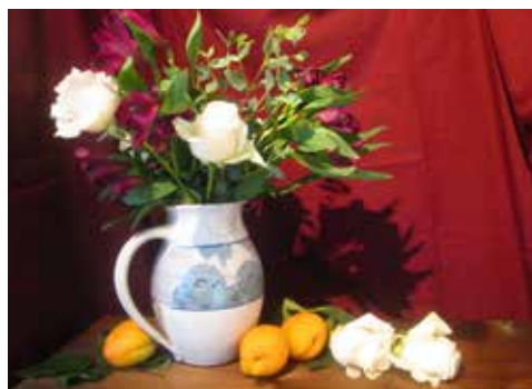
One of the exquisite still life set ups that workshop participants painted.