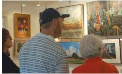
The galleries were filled to capacity with a record, 90 members' artworks.