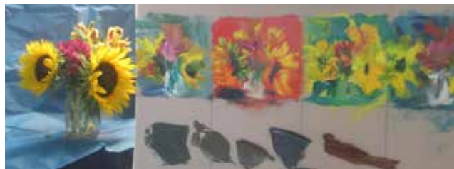
Still life with a student's color exercise.