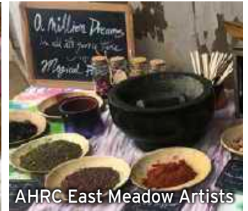
AHRC East Meadow Artists