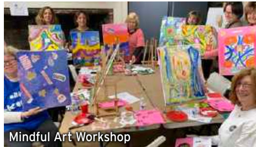
Mindful Art Workshop